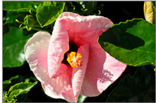
Hollywood Trophy Wife Hibiscus flowers

This plant does best in full sun to partial shade. It requires an evenly moist well-drained soil for optimal growth, but will die in standing water. To help this plant achieve its best flowering performance, periodically apply a flower-boosting fertilizer from early spring through into the active growing season. It is not particular as to soil pH, but grows best in rich soils. It is highly tolerant of urban pollution and will even thrive in inner city environments. Consider applying a thick mulch around the root zone in winter to protect it in exposed locations or colder microclimates. This is a selected variety of a species not originally from North America. It can be propagated by cuttings; however, as a cultivated variety, be aware that it may be subject to certain restrictions or prohibitions on propagation.