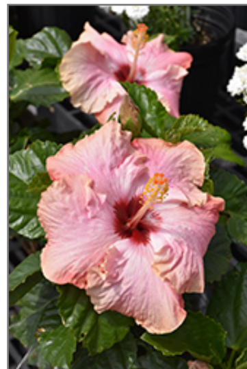
Big Kahuna Hibiscus flowers

This plant does best in full sun to partial shade. It requires an evenly moist well-drained soil for optimal growth, but will die in standing water. To help this plant achieve its best flowering performance, periodically apply a flower-boosting fertilizer from early spring through into the active growing season. It is not particular as to soil pH, but grows best in rich soils. It is highly tolerant of urban pollution and will even thrive in inner city environments. Consider applying a thick mulch around the root zone in winter to protect it in exposed locations or colder microclimates. This is a selected variety of a species not originally from North America. It can be propagated by cuttings; however, as a cultivated variety, be aware that it may be subject to certain restrictions or prohibitions on propagation.