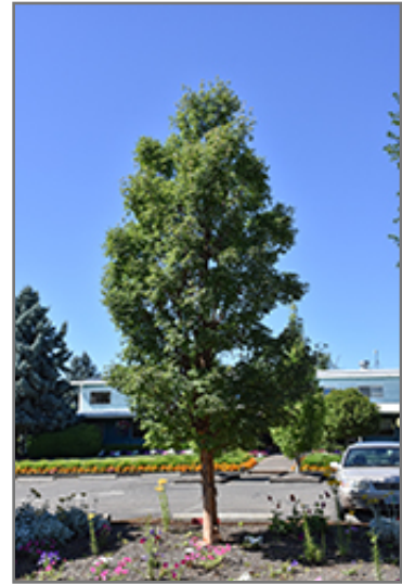
Copper Rocket Paperbark Maple

Copper Rocket Paperbark Maple will grow to be about 25 feet tall at maturity, with a spread of 12 feet. It has a high canopy with a typical clearance of 6 feet from the ground, and should not be planted underneath power lines. As it matures, the lower branches of this tree can be strategically removed to create a high enough canopy to support unobstructed human traffic underneath. It grows at a slow rate, and under ideal conditions can be expected to live for 80 years or more.