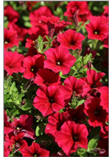
ColorRush Red Petunia flowers