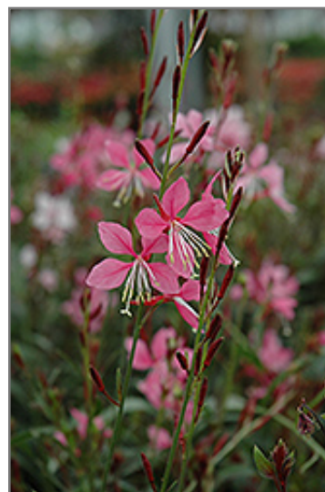
Ballerina Rose Gaura flowers