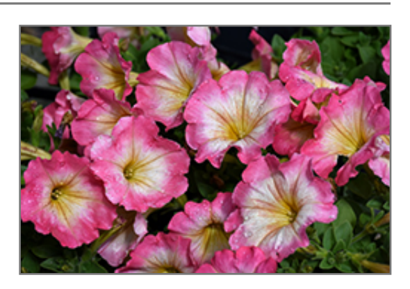
Pink Halo Ray Petunia flowers

A beautiful semi-trailing series featuring large, early flowering, creamy white blooms with pink edges, cascading from simple, green foliage; excellent uniformity, ideal for containers, hanging baskets or added to garden beds; deadhead for neat appearance