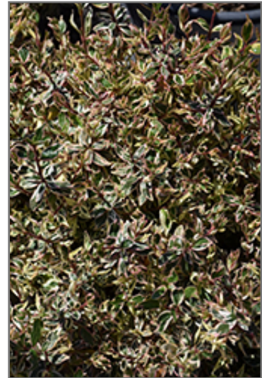
Vanilla Brandy Abelia foliage

Vanilla Brandy Abelia will grow to be about 3 feet tall at maturity, with a spread of 3 feet. It tends to fill out right to the ground and therefore doesn't necessarily require facer plants in front. It grows at a slow rate, and under ideal conditions can be expected to live for approximately 30 years.