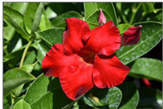
Tropical Breeze Velvet Red Mandevilla flowers