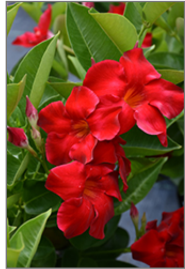
Tropical Breeze Velvet Red Mandevilla flowers

This plant is native to the tropics and prefers growing in moist environments with evenly warm conditions all year round. In our climate, it is usually grown as an outdoor annual in the garden or in a container. If you want it to survive the winter, it can be brought in to the house and provided with special care, and then returned to the garden the following season. In its preferred tropical habitat, it can grow to be around 10 feet tall at maturity, with a spread of 24 inches. However, when grown as an annual or when overwintered indoors, it can be expected to perform differently, and its exact height and spread will depend on many factors; you may wish to consult with our experts as to how it might perform in your specific application and growing conditions.