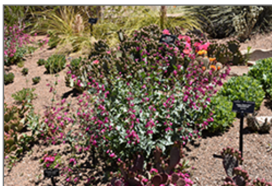
Desert Beard Tongue in bloom