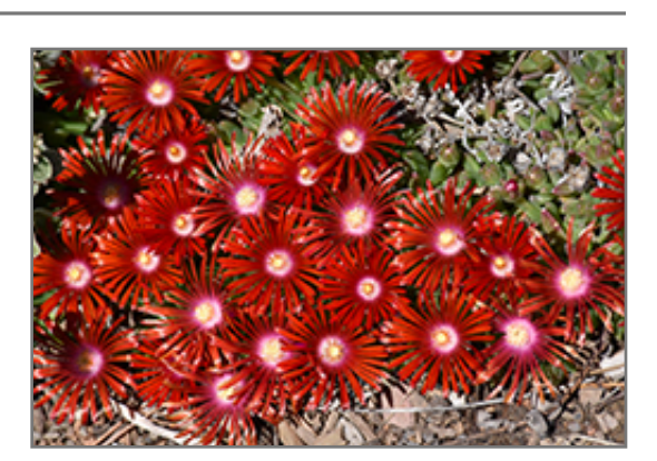
Red Mountain Ice Plant flowers

Low growing carpet-like, succulent, native to South Africa but amazingly hardy in North America; dazzling red-violet daisy-like flowers with white eyes; perfect for xeriscapes, rock gardens, screes and sandy soils