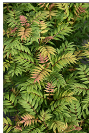
Mr. Mustard False Spirea foliage