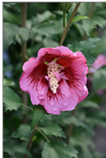
Red Pillar Rose of Sharon flowers