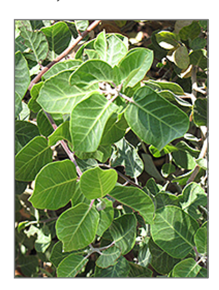
Pink Flowering Sumac foliage

Pink Flowering Sumac is recommended for the following landscape applications;