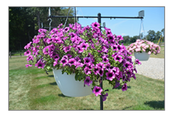
Main Stage Blueberry Petunia in bloom