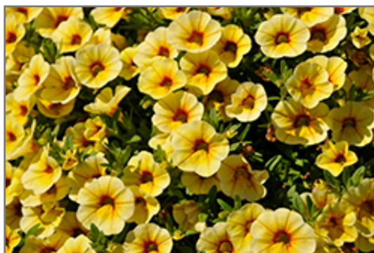
MiniFamous Uno Yellow+Red Vein Calibrachoa flowers

MiniFamous Uno Yellow+Red Vein Calibrachoa is recommended for the following landscape applications;