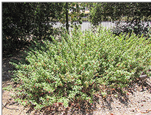
Carmine Bells Correa