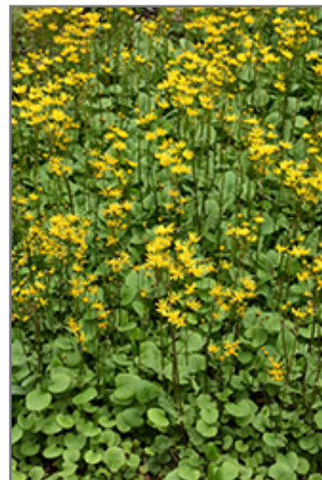
Golden Ragwort in bloom