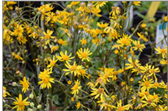
Golden Ragwort flowers

This plant is not reliably hardy in our region, and certain restrictions may apply; contact the store for more information.