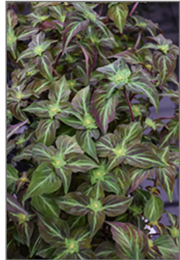
Night Light Moneywort foliage

Night Light Moneywort is recommended for the following landscape applications;