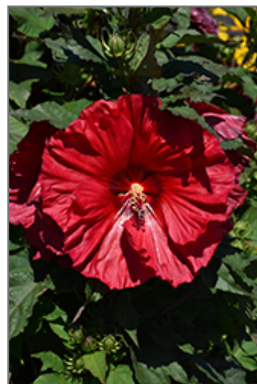
Summerific Valentine's Crush Hibiscus flowers

This bold garden perennial features showy ruffled, large, bright red flowers that are produced at the nodes all up the stems; attractive, glossy, dark-green/bronze leaves; ideal for the mixed garden border or in mass; do not allow to dry to wilting point