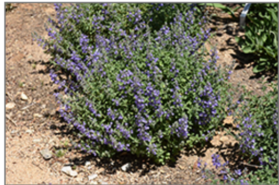
Sylvester Blue Catmint in bloom