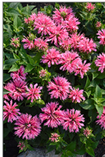
Pink Lace Beebalm flowers

A compact, upright form of bee balm that produces abundant heads of bright pink flowers in mid summer, above dense, rounded clumps of bright green foliage; good disease resistance; great for massing in the middle of flower borders