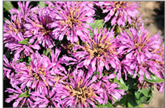
Pardon My Lavender II Beebalm flowers