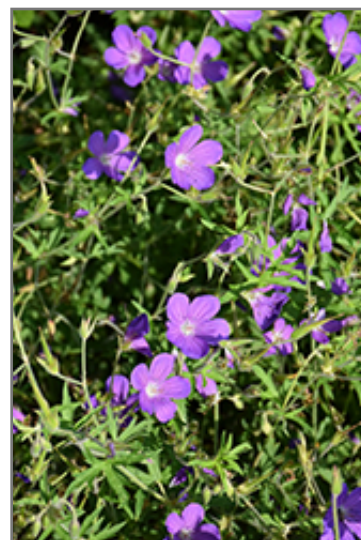
Nimbus Cranesbill flowers