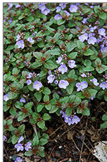
Waterperry Blue Speedwell in bloom