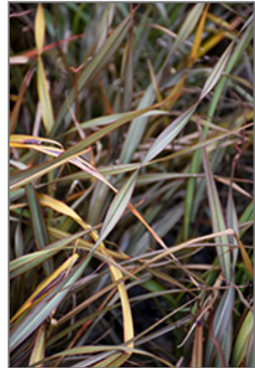
Surfer New Zealand Flax foliage