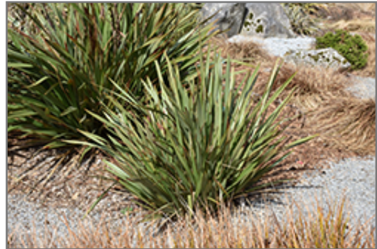
Mountain Flax