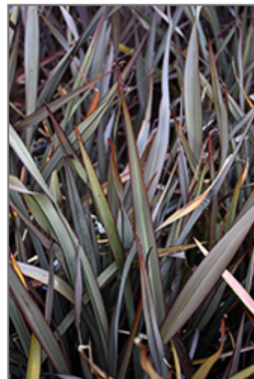
Black Rage New Zealand Flax foliage