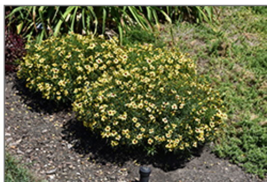
Sizzle And Spice Sassy Saffron Tickseed in bloom