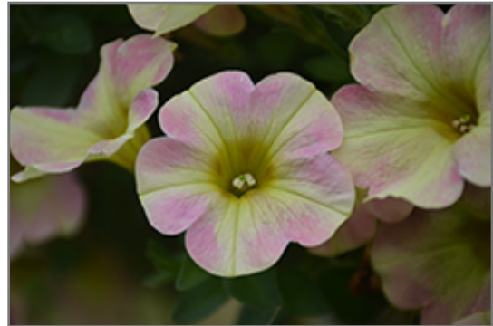
Fortunia Early Sunrise Petunia flowers