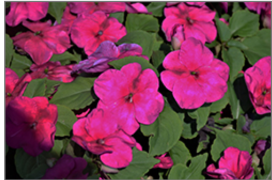
Xtreme Violet Impatiens flowers

Xtreme Violet Impatiens is recommended for the following landscape applications;