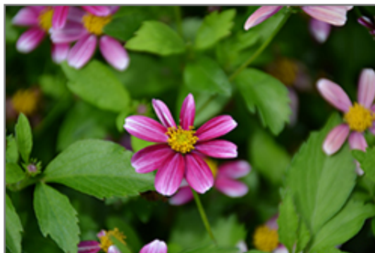
Cupcake Strawberry Bidens flowers