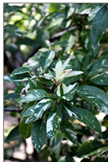
Palette Chinese Stranvaesia foliage