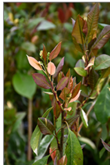
Palette Chinese Stranvaesia foliage