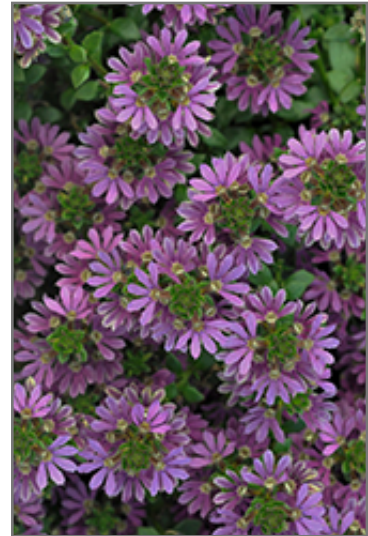
Surdiva Purple Fan Flower flowers