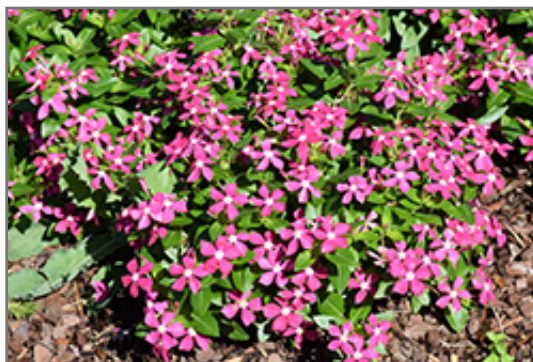
Soiree Kawaii Red Vinca in bloom