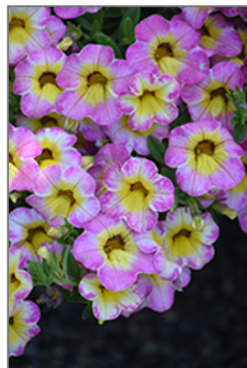
Cha-Cha Diva Hot Pink Calibrachoa flowers