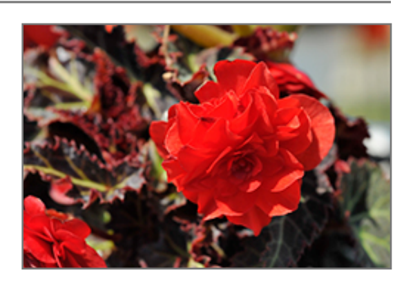
l'Conia Red Begonia flowers

A beautiful vigorous, semi-trailing variety ideal for patio containers and hanging baskets; featuring large, vibrant red double blooms nestled on top of deep and dark green foliage with black overtones; low maintenance, deadhead to encourage new growth