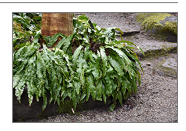
Hart's Tongue Fern

Hart's Tongue Fern will grow to be about 24 inches tall at maturity, with a spread of 24 inches. When grown in masses or used as a bedding plant, individual plants should be spaced approximately 18 inches apart. Its foliage tends to remain dense right to the ground, not requiring facer plants in front. It grows at a fast rate, and under ideal conditions can be expected to live for approximately 10 years. As an evegreen perennial, this plant will typically keep its form and foliage year-round.