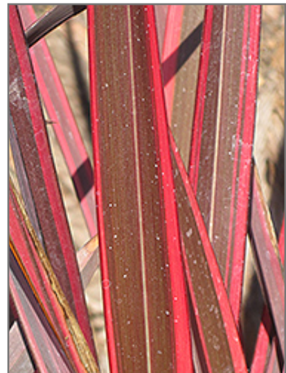
Guardsman New Zealand Flax foliage