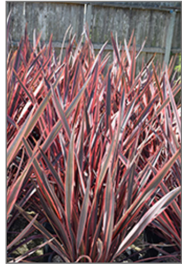
Guardsman New Zealand Flax