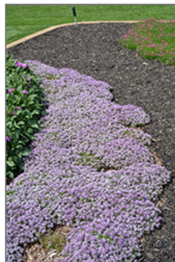
Yolo Lavender Sweet Alyssum in bloom