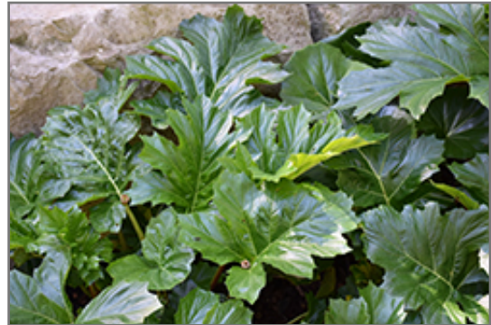
Oak Leaf Bear's Breeches