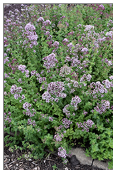
Oregano flowers