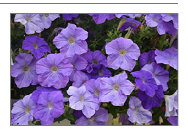
Sanguna Patio Light Blue Petunia flowers

A beautiful compact variety that features bold colored blooms on green foliage; an upright habit creates the perfect addition to patio containers, borders and small gardens; a low maintenance pollinator plant