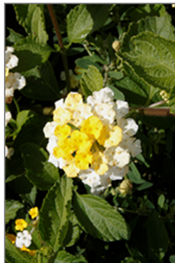
Landscape Bandana Lemon Zest Lantana flowers