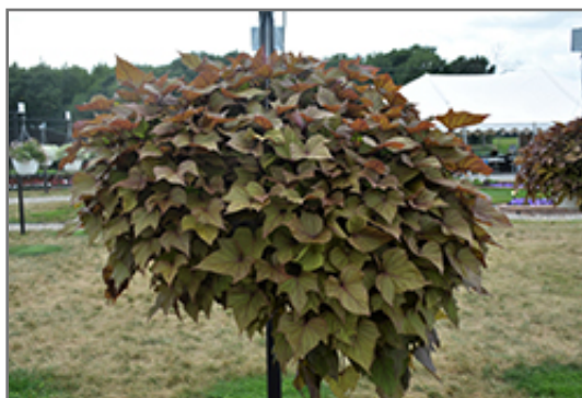
Sidekick Heart Bronze Sweet Potato Vine

Sidekick Heart Bronze Sweet Potato Vine is a fine choice for the garden, but it is also a good selection for planting in outdoor containers and hanging baskets. Because of its trailing habit of growth, it is ideally suited for use as a 'spiller' in the 'spiller-thriller-filler' container combination; plant it near the edges where it can spill gracefully over the pot. Note that when growing plants in outdoor containers and baskets, they may require more frequent waterings than they would in the yard or garden.