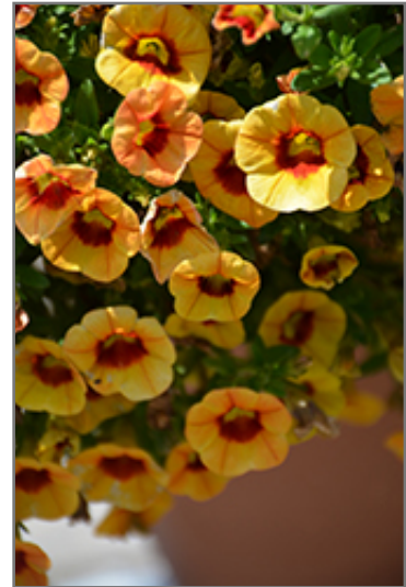
Hula Mango Calibrachoa flowers