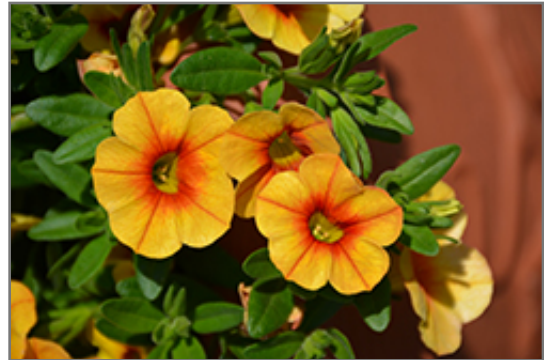
Calitastic Mango Calibrachoa flowers

Calitastic Mango Calibrachoa is recommended for the following landscape applications;