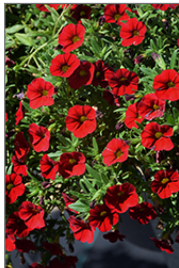
Cabaret Red Calibrachoa flowers