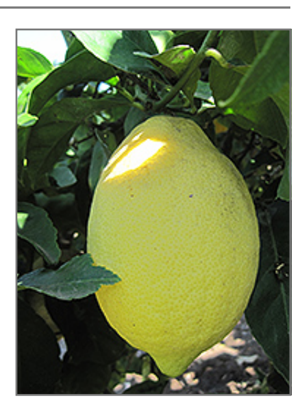
Lemon fruit

Lemon features showy clusters of fragrant white star-shaped flowers with buttery yellow eyes at the ends of the branches from early to mid spring, which emerge from distinctive lilac purple flower buds. It has attractive dark green foliage with light green undersides which emerges brick red in spring. The glossy oval leaves are highly ornamental and remain dark green throughout the winter. It features an abundance of magnificent yellow berries from late fall to late winter. The fruit can be messy if allowed to drop on the lawn or walkways, and may require occasional clean-up.