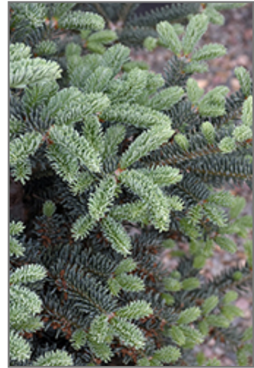
Tyler Blue Balsam Fir foliage

This tree does best in full sun to partial shade. It prefers to grow in moist to wet soil, and will even tolerate some standing water. It is particular about its soil conditions, with a strong preference for sandy, acidic soils. It is quite intolerant of urban pollution, therefore inner city or urban streetside plantings are best avoided, and will benefit from being planted in a relatively sheltered location. Consider applying a thick mulch around the root zone in winter to protect it in exposed locations or colder microclimates. This is a selection of a native North American species.