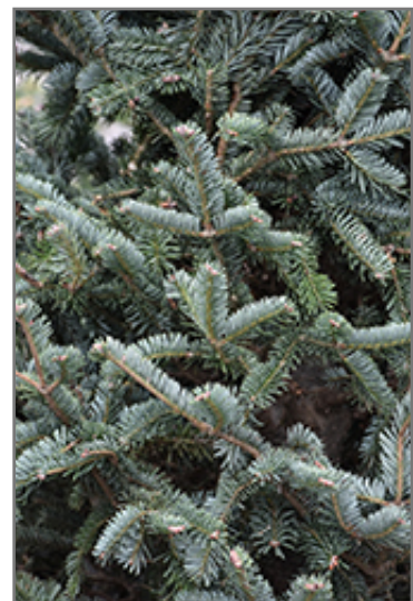
Tyler Blue Balsam Fir foliage