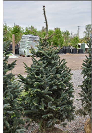
Tyler Blue Balsam Fir

Tyler Blue Balsam Fir will grow to be about 25 feet tall at maturity, with a spread of 15 feet. It has a low canopy, and should not be planted underneath power lines. It grows at a medium rate, and under ideal conditions can be expected to live for 70 years or more.