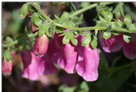
Polkadot Princess Foxglove flowers